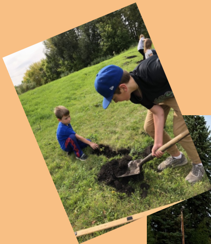
Ag Option Class and Gr. 1's planting Cherry Trees

Hold and Secure is a process used to lock all exit/entrance (exterior) doors of the school when there is an emergency situation in close proximity to the school, outside the school on school grounds and/or unrelated to the school. Be sure to ask your child(ren) how our drills are going.