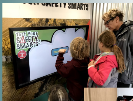
The school learned about farm safety with an excellent safety presentation and trailer filled with hands on learning.