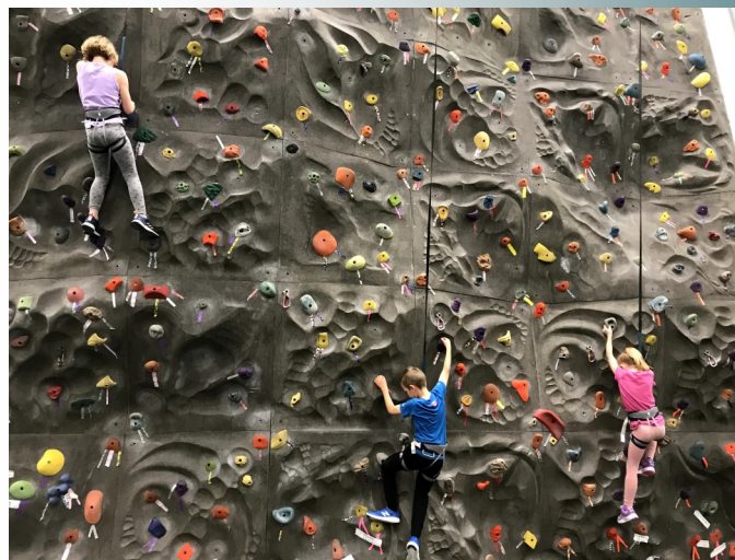
The grade 2/3 class got an introduction to their rock and minerals unit with an excellent field trip. They went to the Collicutt centre to do some rock climbing and then went to the rock and gem show at the Westerner. They really "rocked!"